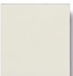
TIGER Drylac ® 09/10890 RAL9002 Grey White Int. 20±5