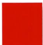
TIGER Drylac ® 49/31040 RAL 3020 Traffic Red 85±5