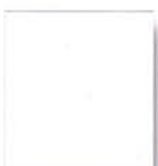
TIGER Drylac ® 39/10210 Apollo White 90±5