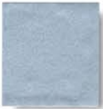
TIGER Drylac ® 49/99999 Bengal Silver