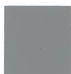
TIGER Drylac ® 69/70000 Zinc Free Primer 3±2