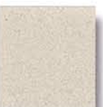
TIGER Drylac ® 44/10033 Quartzite Smooth Matte

Gloss level according to Gardner 60° ASTM D523.