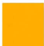
TIGER Drylac ® 49/22240 RAL 1033 Yellow 85±5