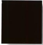
TIGER Drylac ® 49/62070 Rail Bronze Matte 60±5