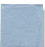
TIGER Drylac ® 49/00280 Clear Semi-Gloss