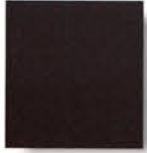
TIGER Drylac ® 44/60034 Breccia Smooth Matte