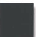
TIGER Drylac ® 69/90350 Zinc Rich Primer 70±5