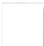
TIGER Drylac ® 49/11111 Bengal White 95±5