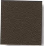
TIGER Drylac ® 49/60015 Pyrite Fine Texture