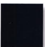
TIGER Drylac ® 39/80020 Black Matte 20±5