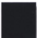
TIGER Drylac ® 39/80200 Black Fine Texture