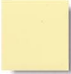
TIGER Drylac ® 39/15010 Beige 90±5