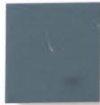
TIGER Drylac ® 39/90177 Xtreme Chrome

Paper and ink limitations of color samples as well as influence from heat and light account for differences from actual powder coatings.