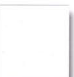
TIGER Drylac ® 49/13721 Blanco 90±5