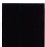
TIGER Drylac ® 49/81430 Black 40±5