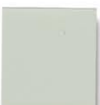
TIGER Drylac ® 49/73510 RAL 7035 Light Grey 85±5