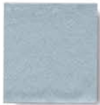
TIGER Drylac ® 49/90380 Standard Silver