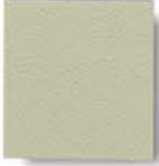
TIGER Drylac ® 49/13750 Beige Fine Texture