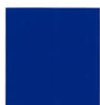
TIGER Drylac ® 49/44444 Bengal Blue 95±5