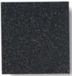
TIGER Drylac ® 44/80026 Graphite Smooth Matte