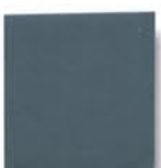
TIGER Drylac ® 49/00530 Clear Gloss