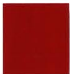
TIGER Drylac ® 49/31100 RAL 3003 Ruby Red 85±5