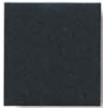
TIGER Drylac ® 49/80190 Iron Glimmer P-7