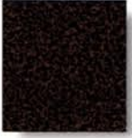
TIGER Drylac ® 09/90180 Copper Antique/Vein