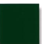
TIGER Drylac ® 49/55555 Bengal Green 95±5