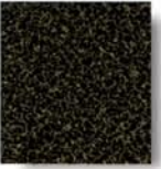
TIGER Drylac ® 09/90200 Gold Antique/Vein