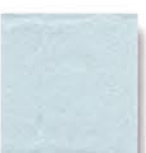
TIGER Drylac ® 16/00030 Clear Matte

Gloss level according to Gardner 60° ASTM D523.