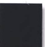
TIGER Drylac ® 69/80331 Black Interior 4±2