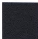
TIGER Drylac ® 39/80170 Black Wrinkle