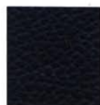
TIGER Drylac ® 09/80450 RAL 9011 Black RT Matte