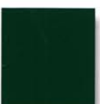
TIGER Drylac ® 49/51610 OGF Moss Green 80±5