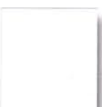
TIGER Drylac ® 49/11350 White Matte 20±5