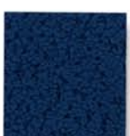
TIGER Drylac ® 39/43011 Blue Hammetone