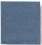
TIGER Drylac ® 49/91260 Mirror Silver