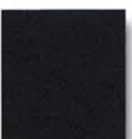
TIGER Drylac ® 49/81241 Black Extra Fine Texture