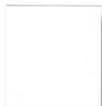
TIGER Drylac ® 49/11570 Nature White RT Glossy