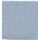
TIGER Drylac ® 49/90450 Sparkle Silver