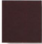
TIGER Drylac ® 44/60035 Lava Smooth Matte