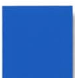
TIGER Drylac ® 49/42330 RAL 5015 Sky Blue 85±5