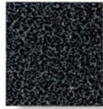
TIGER Drylac ® 09/90190 Silver Antique/Vein