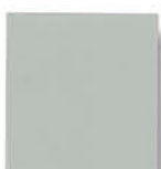
TIGER Drylac ® 09/73841 Outg. Forgiving Primer 70±5