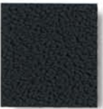
TIGER Drylac ® 39/80005 Black Hammetone