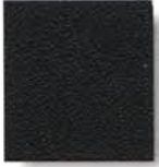
TIGER Drylac ® 49/62721 Brown Fine Texture