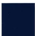
TIGER Drylac ® 39/44500 Post Office Blue 85±5