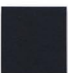
TIGER Drylac® 59/80460 Black Fine Texture