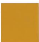
TIGER Drylac® 59/20360 New Cat Yellow 45±5