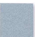
TIGER Drylac® 59/91171 Nu Sparkle Silver Metallic