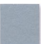
TIGER Drylac® 59/90823 Standard Silver Metallic