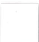
TIGER Drylac® 59/10525 Sky White 85±5