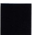
TIGER Drylac® 59/80991 RAL 9011 Graphite Black RTG

Gloss level according to Gardner 60° ASTM D523.