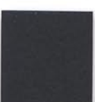
TIGER Drylac® 59/90831 P7 Iron Glimmer Metallic