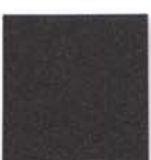
TIGER Drylac® 59/91611 Oil Rub Bronze Metallic