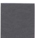
TIGER Drylac® 59/91251 Spindle Bronze Metallic