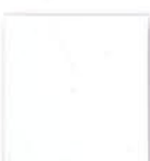
TIGER Drylac® 59/10570 Extrusion White 85±5