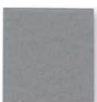
TIGER Drylac® 59/91181 Nu Nickel Metallic