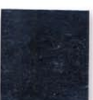
TIGER Drylac® 59/91265 Mirror Silver Metallic*