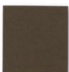
TIGER Drylac® 59/66241 Anodized C33 Metallic