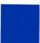
TIGER Drylac® 59/40653 Mercury Blue 85±5