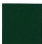
TIGER Drylac® 59/50413 RAL 6005 Moss Green 85±5

Paper and ink limitations of color samples as well as influence from heat and light account for differences from actual powder coatings.