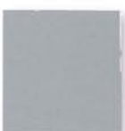
TIGER Drylac® 59/93371 RAL 9006 White Aluminum Metallic