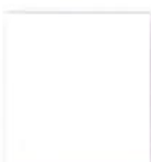
TIGER Drylac® 59/10560 Apollo White 85±5