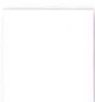
TIGER Drylac® 59/10575 W W White 85±5