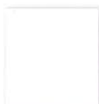
TIGER Drylac® 59/10530 Horizon White 85±5