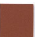
TIGER Drylac® 59/92782 Copper Metallic