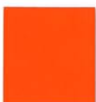
TIGER Drylac® 59/20324 Safety Orange 85±5