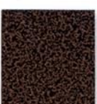
TIGER Drylac® 59/90821 Copper Antique Metallic