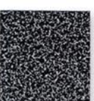
TIGER Drylac® 59/90820 Silver Antique Metallic