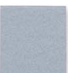
TIGER Drylac® 59/90850 Silver Matte Metallic