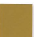
TIGER Drylac® 59/90865 Sahara Gold Metallic

Gloss level according to Gardner 60° ASTM D523.