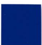
TIGER Drylac® 59/40652 Royal Blue 85±5