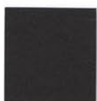
TIGER Drylac® 59/66231 Anodized C34 Metallic