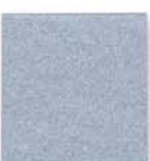
TIGER Drylac® 59/99998 Bengal Silver Metallic*