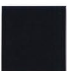
TIGER Drylac® 59/80611 Black 10±5