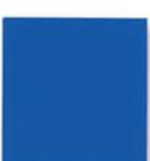
TIGER Drylac® 59/40654 Superak Blue 85±5