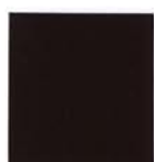
TIGER Drylac® 59/60285 Chocolate Brown 85±5