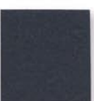
TIGER Drylac® 59/90822 Gun Metal Metallic