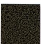
TIGER Drylac® 59/90050 Bronze Antique Metallic